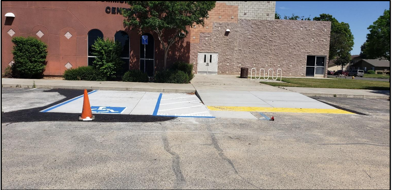
Figure 1 – New Concrete ADA Parking Stall at Pan American Center