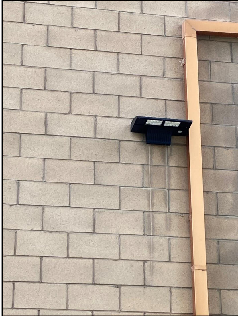
Figure 5 – New LED Lights around John Wells Youth Center Building at Centennial