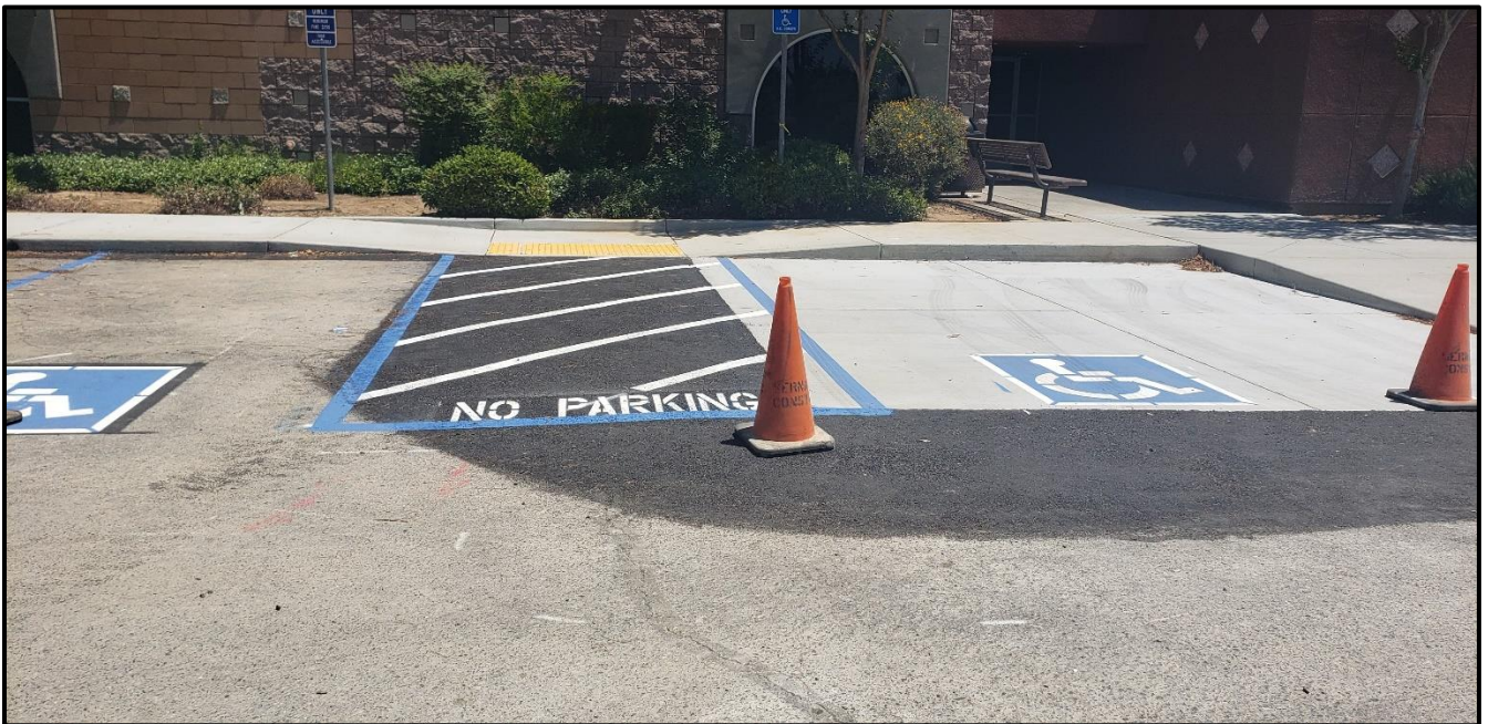
Figure 2 – New Concrete ADA Ramp and Parking Stall at Pan American Center