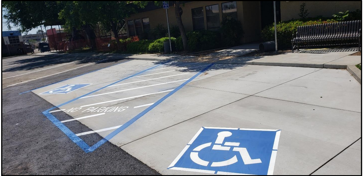
Figure 3 – New Concrete ADA Parking Stall at Frank Bergon Senior Center