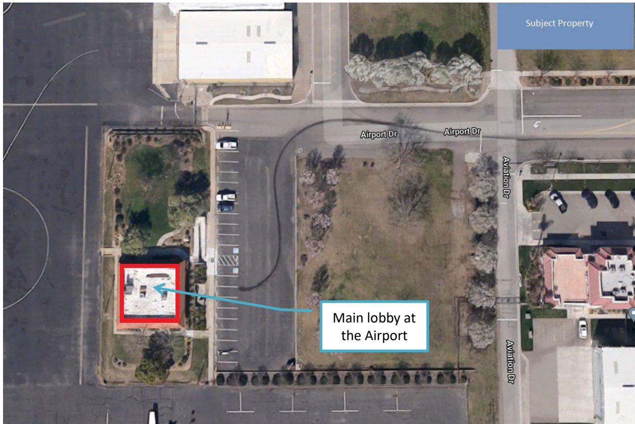
Figure 1: Subject Property