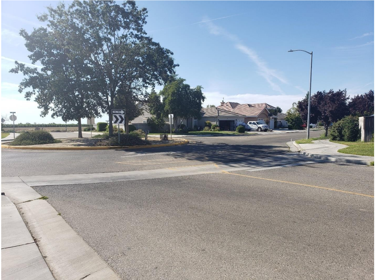
Figure 1 – Photo of Existing Traffic Circle