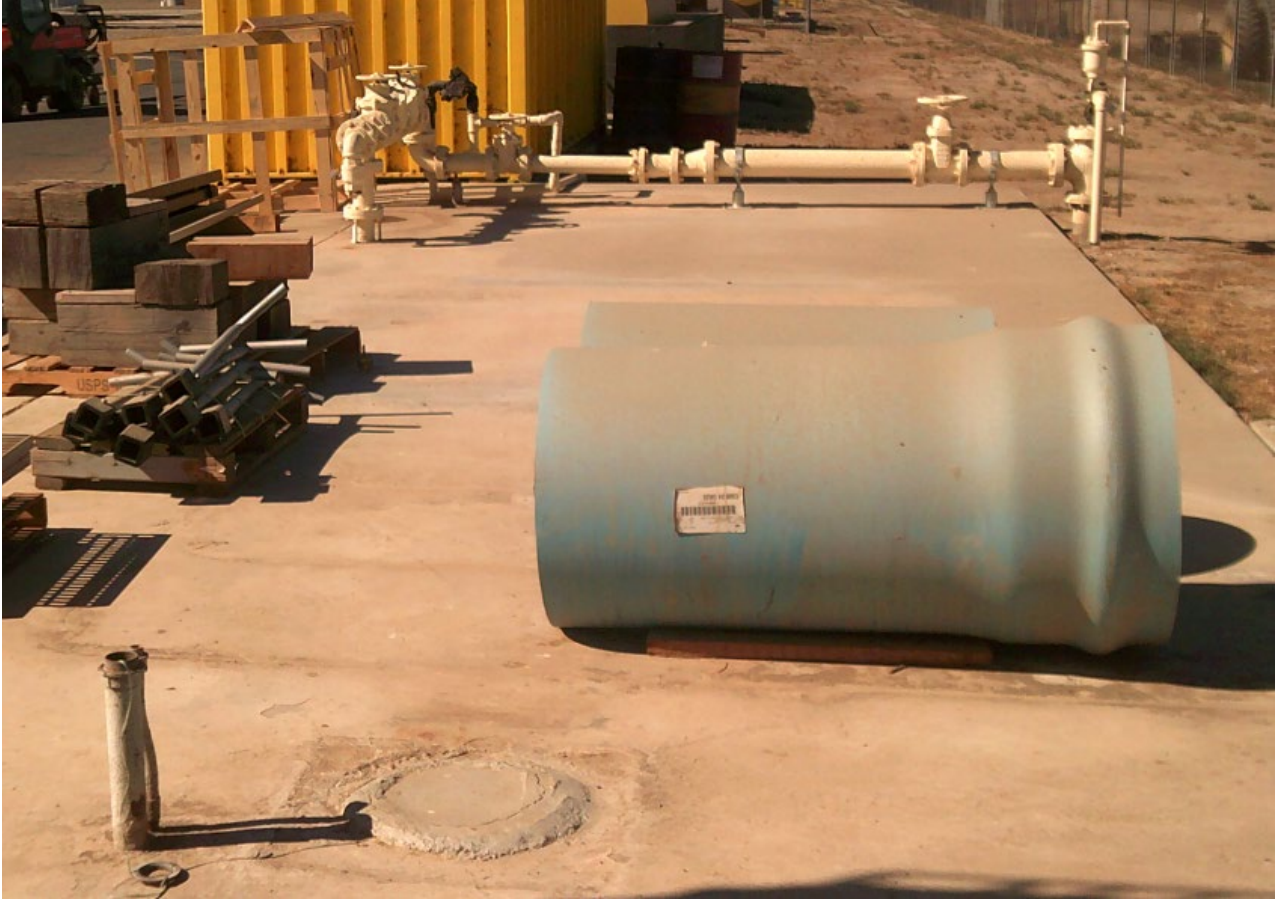
Figure 11: Existing Well #1 and Surge Tank (Removal)