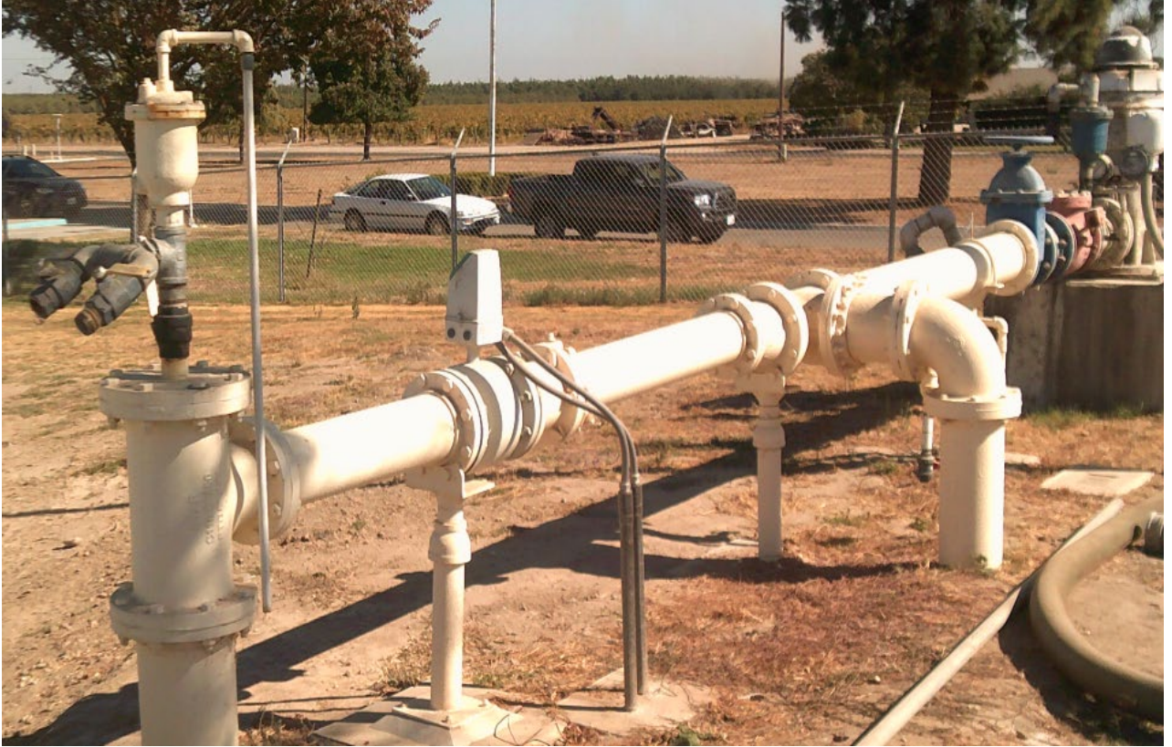
Figure 7: Existing Well # 2 Modifications