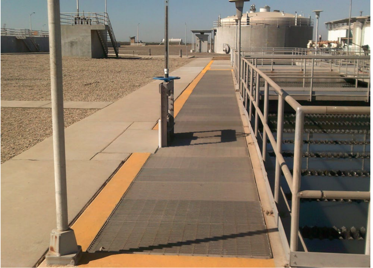
Figure 6: Concrete Repair and Coating