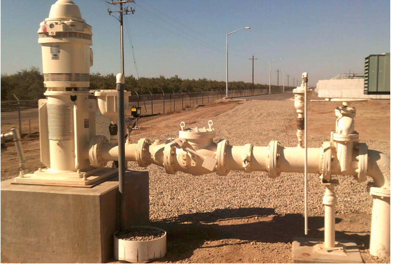
Figure 8: Existing Well #3 with New Wellhead