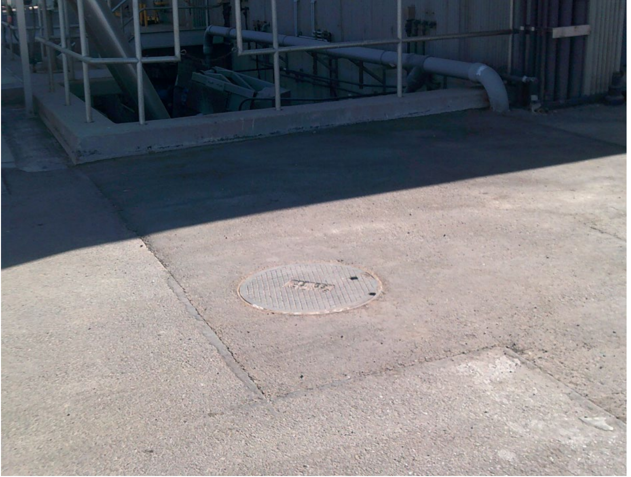
Figure 10: Existing Centrate Drain Pipeline (To Be Lined)