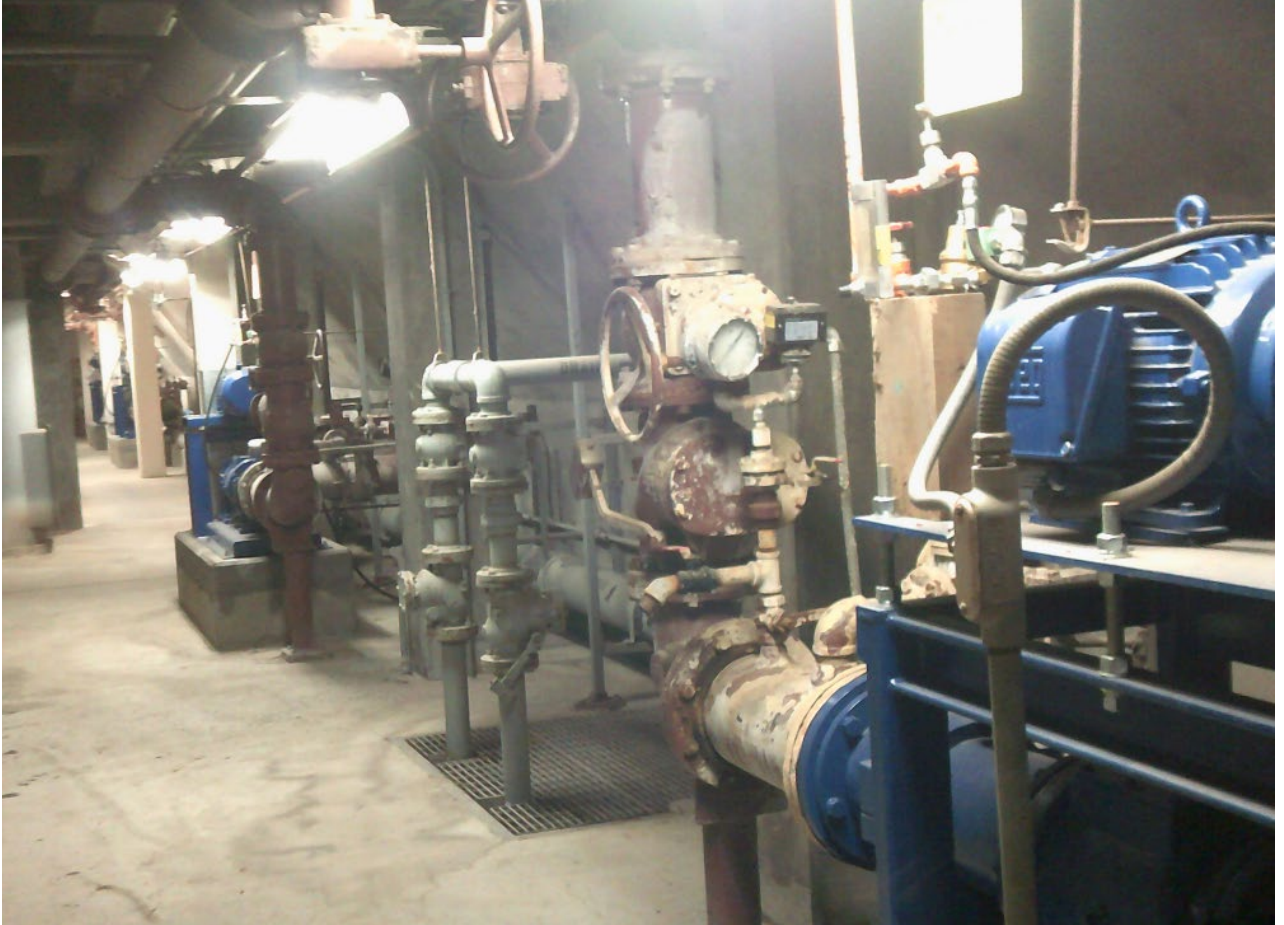
Figure 4: Primary Scum and Sludge Pumps Replacements