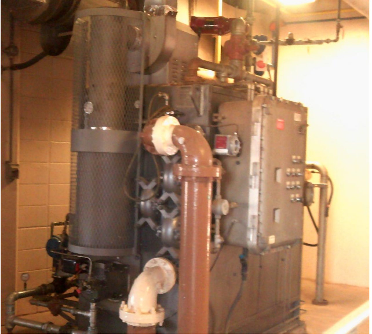
Figure 2: Digester # 1 Heat Exchanger Rehab