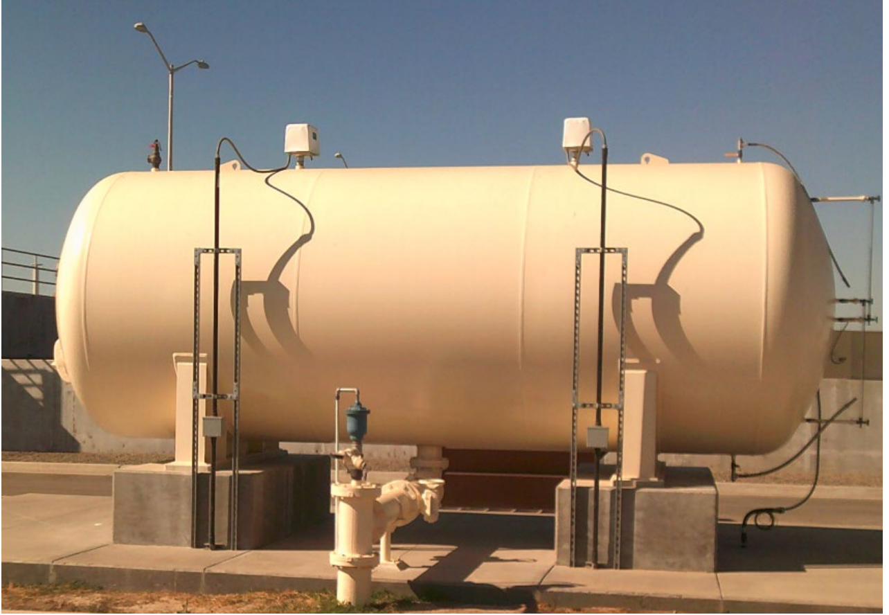
Figure 9: New Surge Tank