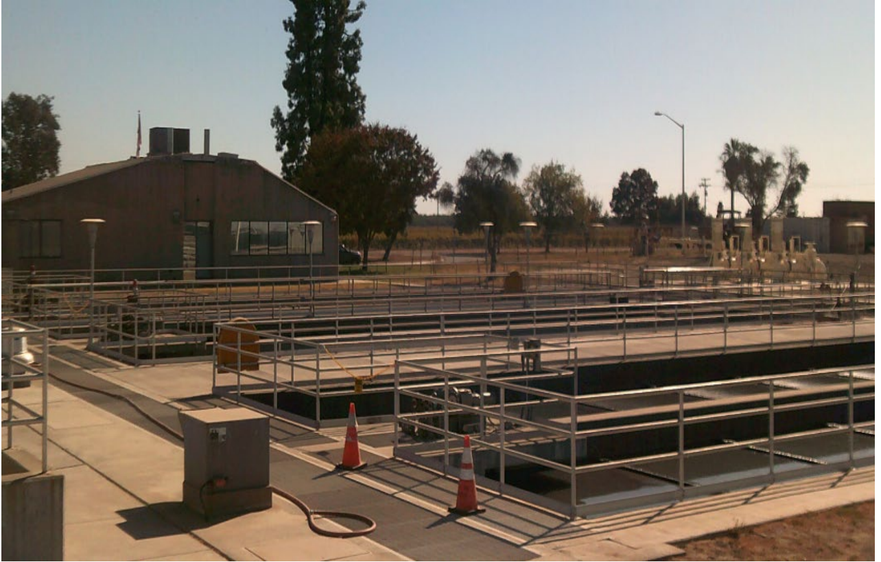
Figure 5: Primary Clarifier # 1-3 New Sludge Collection Equipment