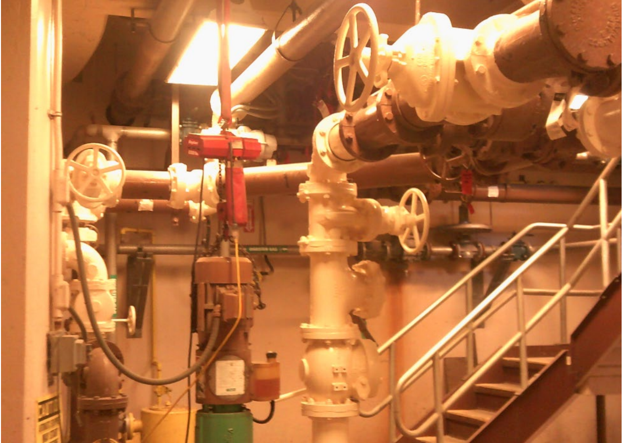
Figure 3: Digester 1-3 Valve Replacement