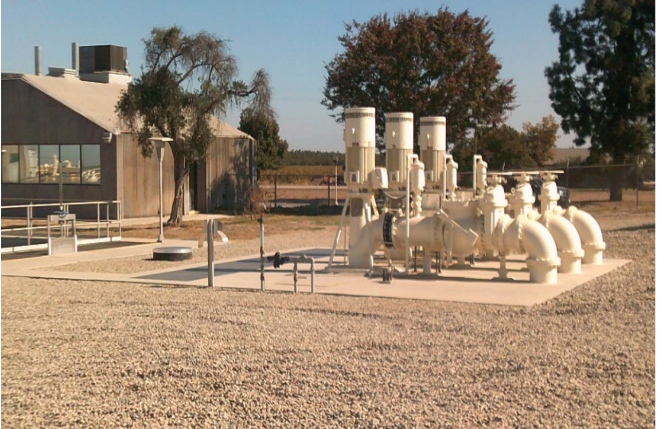
Figure 12: New PEPS