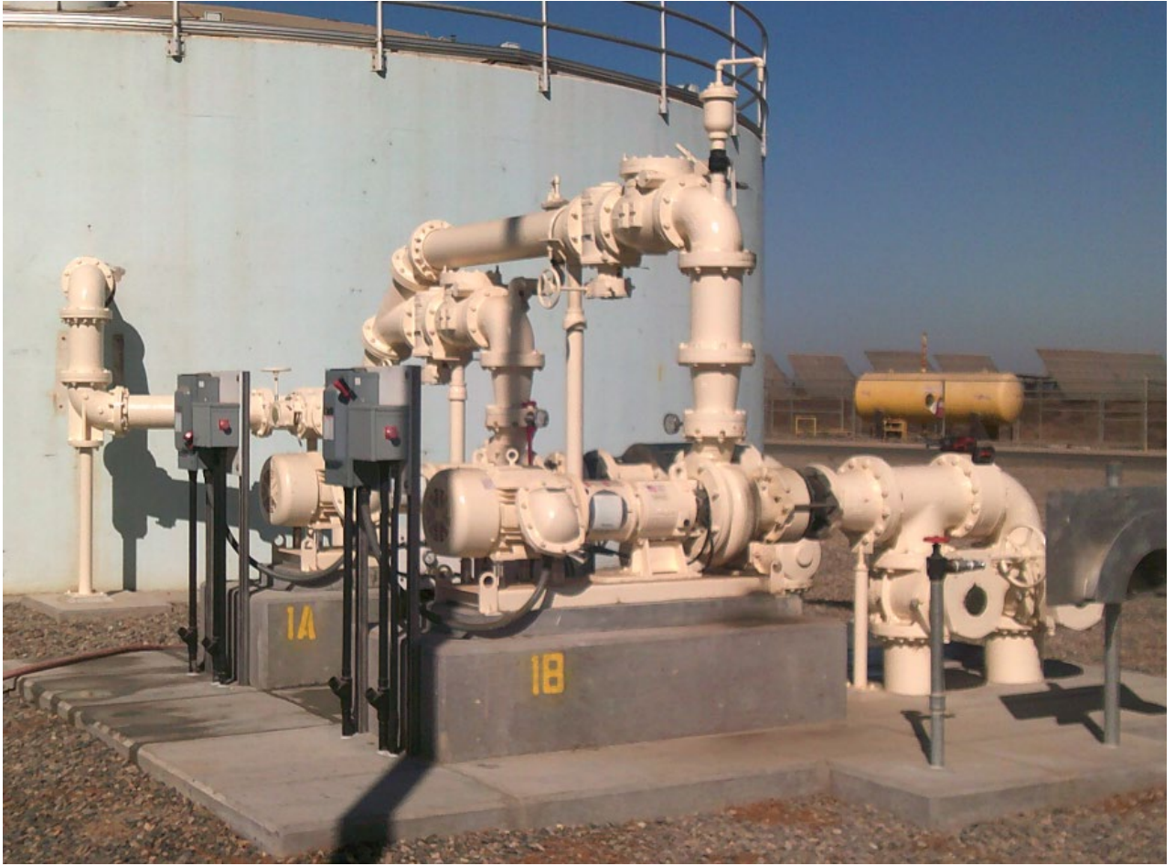
Figure 1: Digester # 1 Mixing System