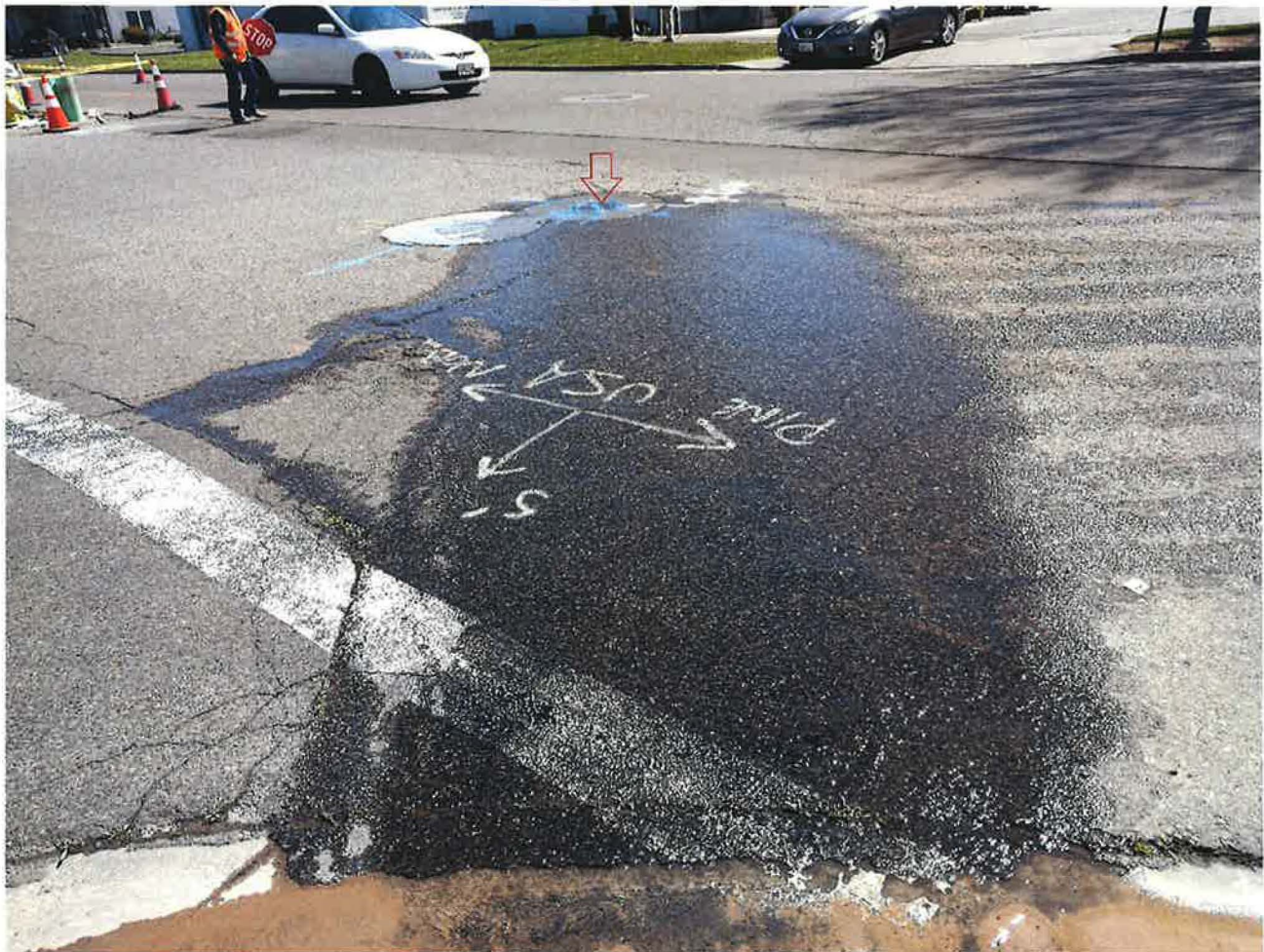
Figure 1 – Emergency repair at Maple Street and Cypress Street (Before Repair)

The original contract amount was $671,037. An additional $12,949 was added to the contract due to an emergency repair of leaking valves at Maple Street and Cypress Street that consisted of removing two gate valves at a tee connection and replacing them with three new gate valves. The replacement of the gate valves was considered an urgent need due to excessive leaking of water into the street as shown in the image below.