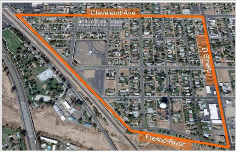
Washington Elementary Residential Corridor